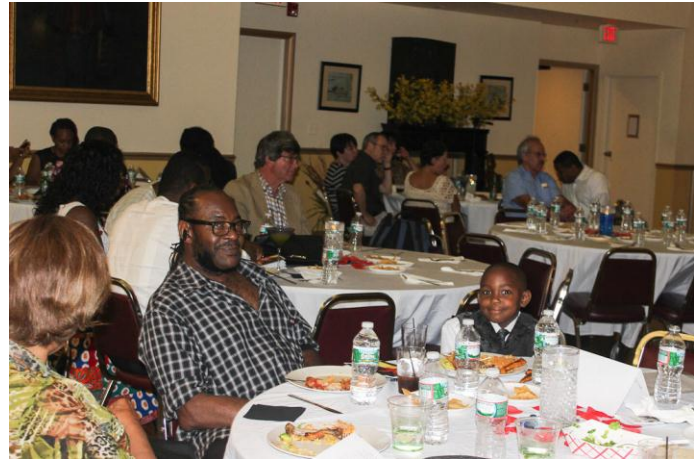
Some guests at the banquet