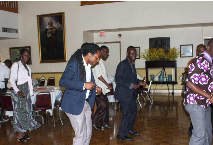
Guests dancing at the banquet